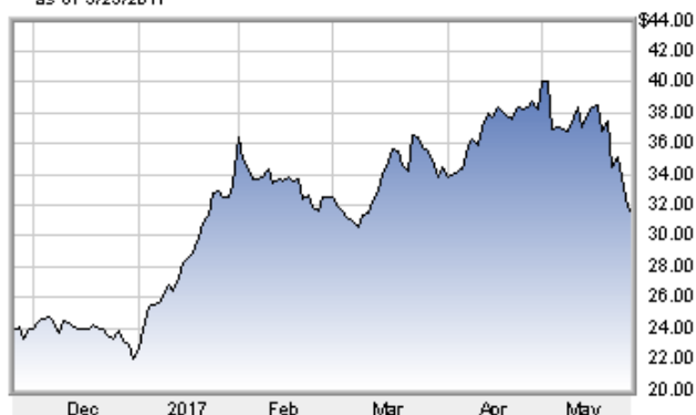
MAKEMYTRIP LIMITED MAURITIUS as of 5/25/2017